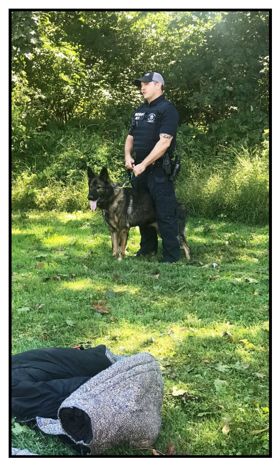
Chester County K-9 Unit