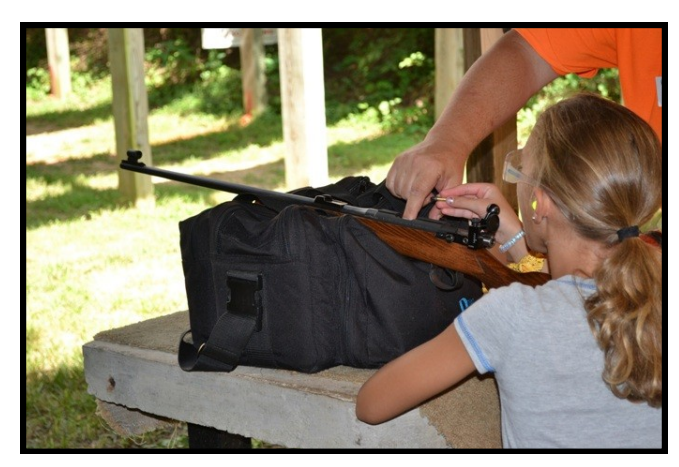
Continued on Page 8