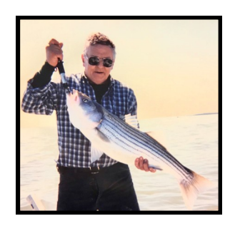
Page 12 - October 2019

From the early 70's he took weekly excursions, if not more, to fish from a boat his favorite spots for a variety of species and as always invited friends.