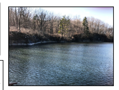
(Continued on page 4)

The Lake was stocked with trout and provided swimming. Because the quarry flooded so quickly there were still pieces of heavy equipment trapped inside.