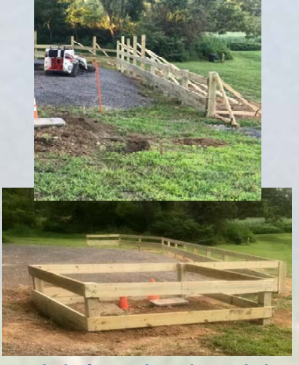
...and check out the safety rail that volunteers built around the lake parking area! You can enter lot from the upper side and exit from the lower end