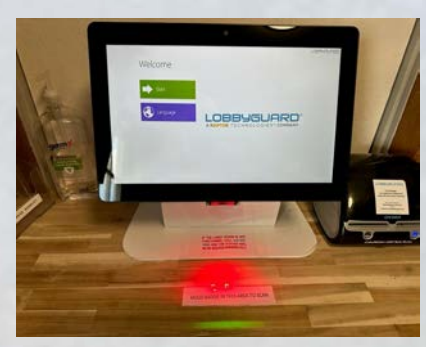
...a new LobbyGuard for checking in and out...