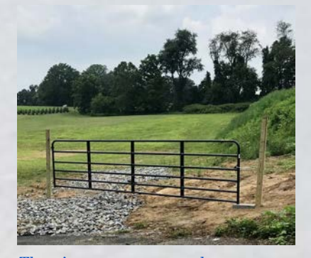
There's a new gate at the entrance to the front field...

The club has made some improvements around the property.