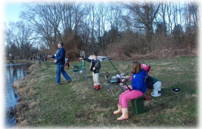
A great day for family fun