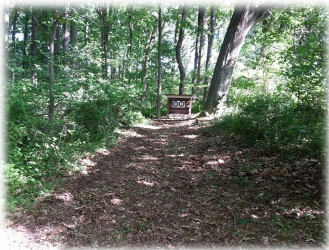
Outdoor Archer Course

If you enjoy archery, you should make time to try out the 14 target outdoor course which you can access from Byrd Rd.