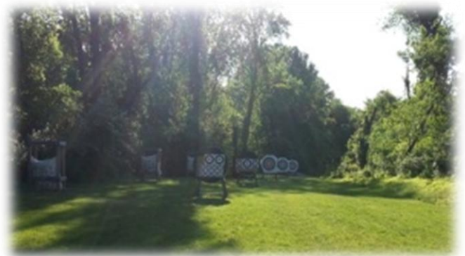
Outdoor Archery Range

If you need to sight in your bow, you may want to try our outdoor practice range behind the clubhouse. Targets there have been placed from 20 yards out to 60 yards in ten yard increments. New target faces were recently installed, so feel free to give them a try.