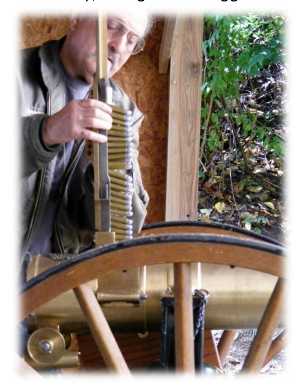
First up, the magnificent Gatling gun

We'll let the pictures the pictures below tell the whole story but if you only visit the club or invite a guest once a year, make it on Field Day.