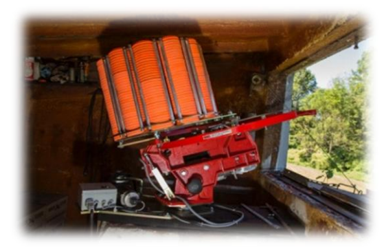
Our new target thrower. Lots of rounds between refills

The Committee recently installed a new, high-capacity target thrower (photo below), bringing our trap range up to ATA specifications.