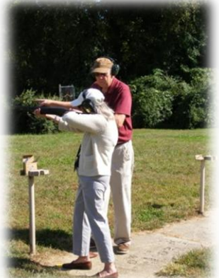
And has some time for the Newsletter Committee, too