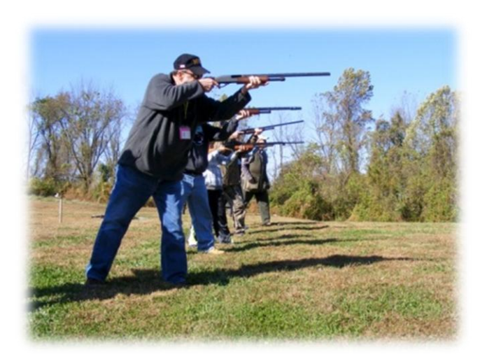
Getting the feel for the point

The Committee recently installed a new, high-capacity target thrower (photo below), bringing our trap range up to ATA specifications.