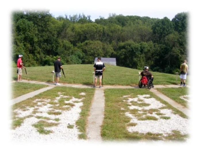
View of the trap field from the stand