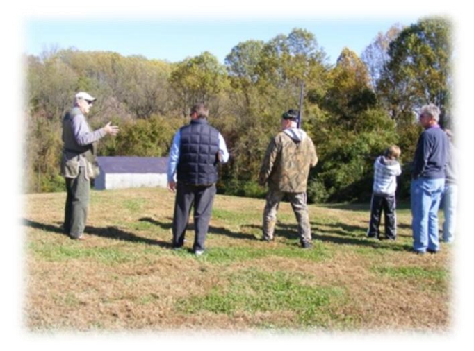
A recent basic shotgun course