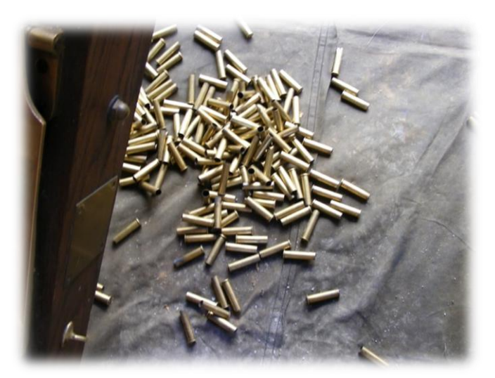
Don't forget to pick up your brass.