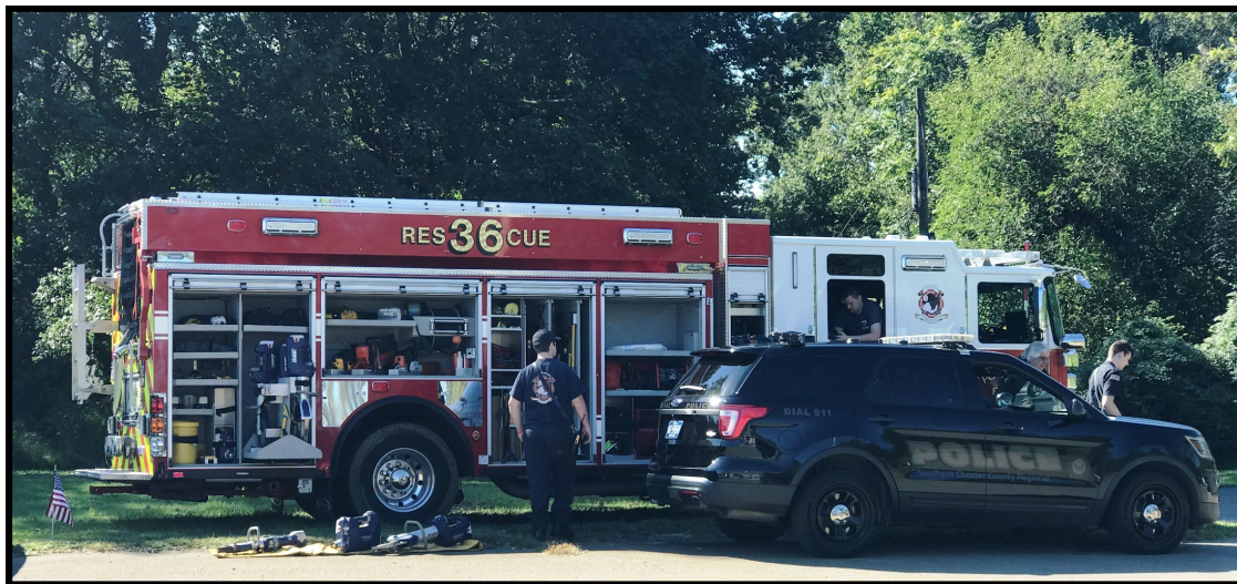
Po-Mar-Lin Fire Co. and Southern Chester County Regional Police