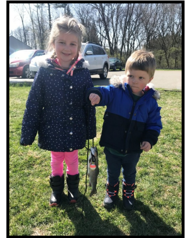
AJ Brazen 12.5 “