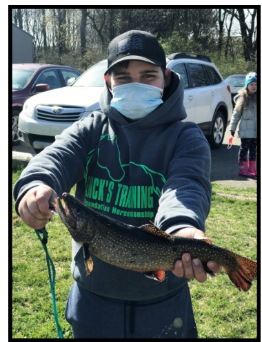
Sower Lease 16.25 “