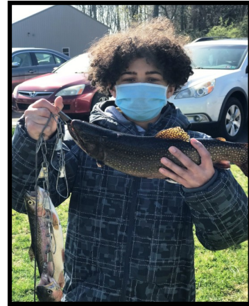
Julian Bond 17.25 "