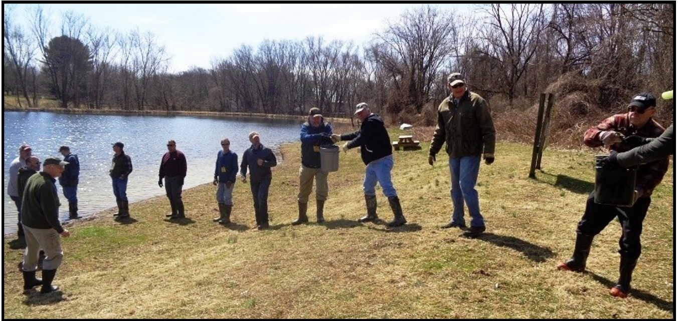
Lake Stocking