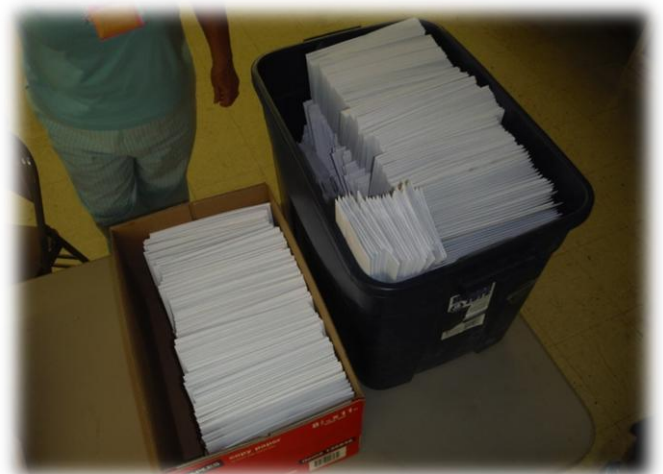
Fourteen hundred envelopes

In little over an hour almost 1,400 envelopes had been stuffed, stamped and ready for delivery to the post office. It was a remarkable example of the SCCS&FA's volunteer spirit and proof positive that many hands make light work.