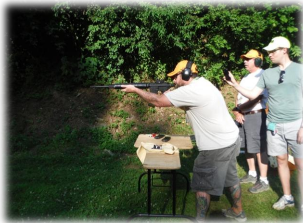
Gun 1: Rifle...

It's true that June 28th fell in the second quarter of 2014 but the NRA Three-Gun Experience was just too much fun to overlook in this edition of the newsletter.