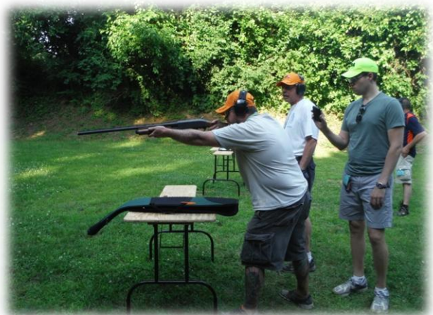
Gun 3: Shotgun.

Seventy-one participants shot pistols, rifles and shotguns (hence, the three-gun title) at a challenging array of static and active targets on two separate courses. Our thirteen volunteers put in more than 110 work hours the day of the event and even more time planning and organizing the affair.