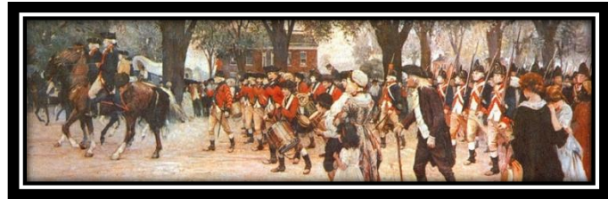
The First Delaware Regiment pays a visit to our Club